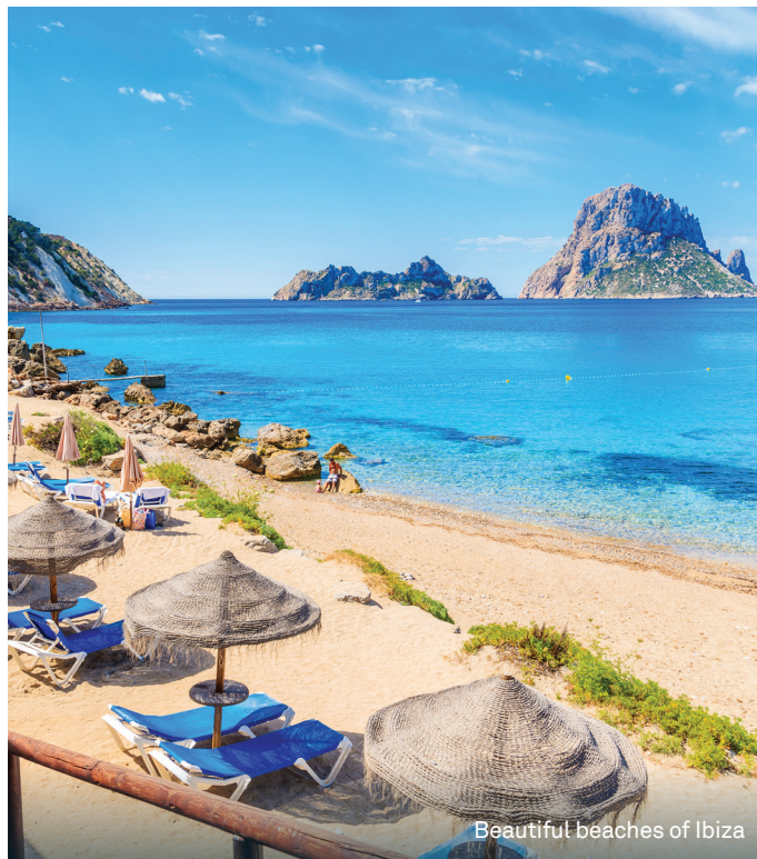
Beautiful beaches of Ibiza

The itinerary is a guide only and may be amended for operational reasons. As such Mayflower & Scenic cannot guarantee the tour will operate unaltered from the itinerary stated above. Please refer to our terms and conditions for further information.