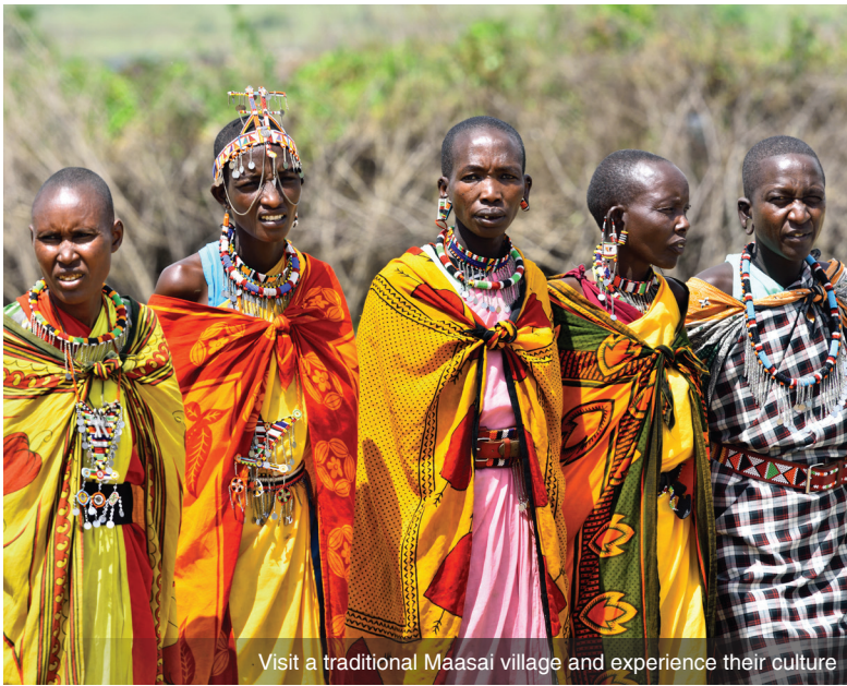
Visit a traditional Maasai village and experience their culture

Rift Valley. Relish in the surrounding sights and sounds of the native wildlife. Beautiful birds along the banks, in the trees, and soaring above; lazy hippos yawning as they emerge from the water; African Fish Eagles swoop down to snatch a fish from the lake for dinner...it all awaits! Check in to the lodge and enjoy a relaxing evening. Meals: B, L, D