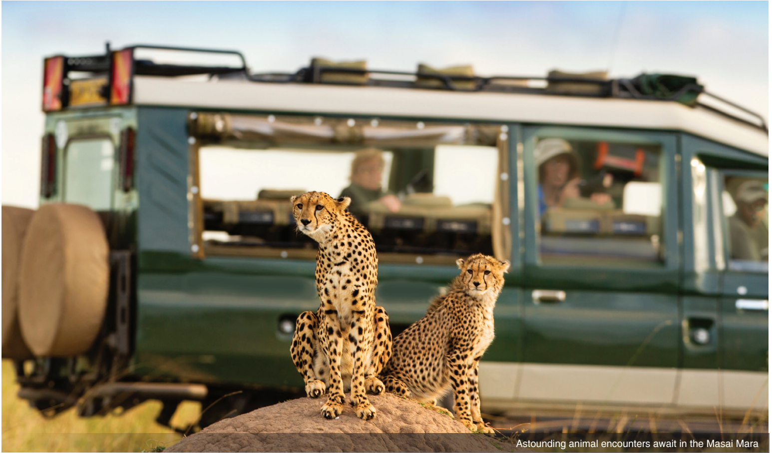
Astounding animal encounters await in the Masai Mara