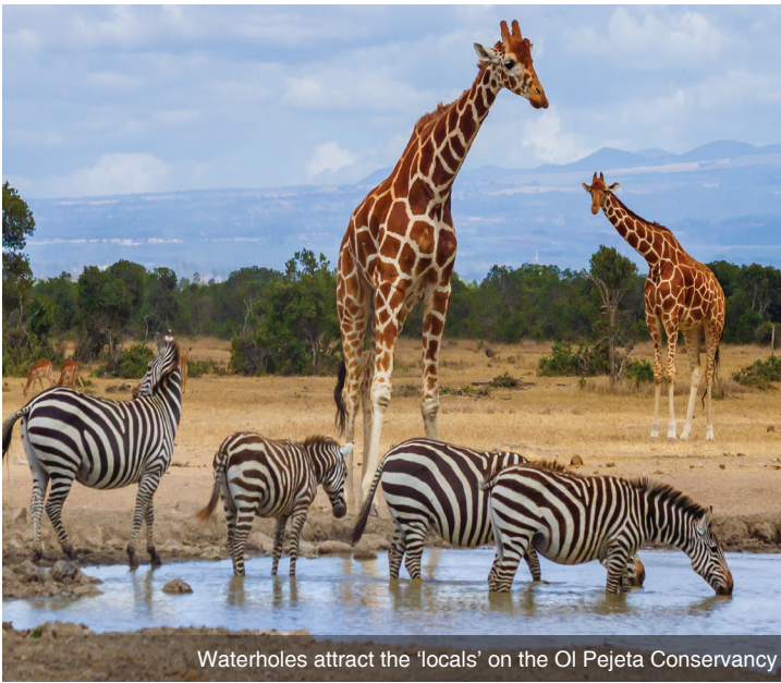
Waterholes attract the 'locals' on the OI Pejeta Conservancy